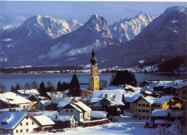
Above, left: The mountains of St. Gilgen