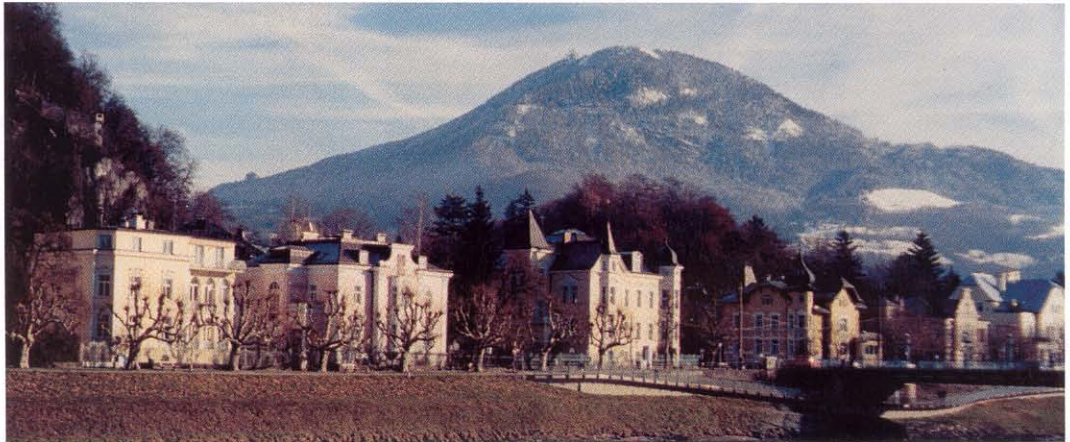
Stately Salzburg residences