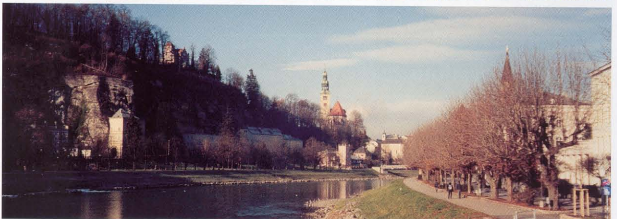
Right: A view of Salzburg from the Salzach River