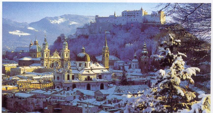
Above, right: The view to the Old City from Monchsberg, Salzburg